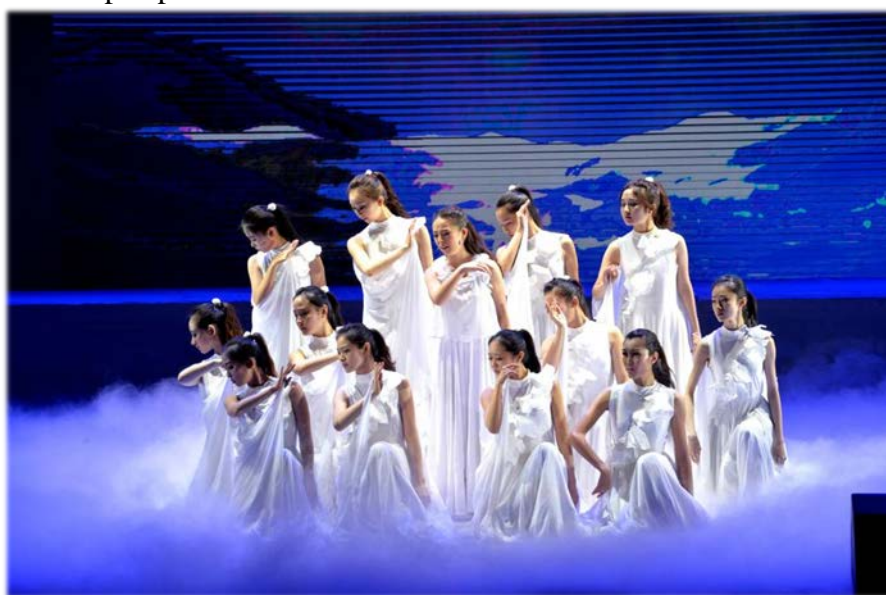
Figure 2 Artistic performance of students majoring in vocal music in Higher Vocational Colleges.

The construction of campus cultural spirit is not only an important core content to strengthen the construction of campus cultural team, but also the highest level knowledge to study campus culture. The construction of campus culture system can be divided into three parts: material culture system construction, spiritual culture system construction and institutional culture system construction. Integrating traditional culture and music education into vocal music teaching in Higher Vocational Colleges undoubtedly plays an important role in promoting the construction of music spiritual and cultural system in higher vocational colleges(2021,Lu Zhida). The whole campus culture construction is the concentrated embodiment of the school cultural personality and spiritual style. Campus spirit education culture, also known as school spirit, is reflected in all aspects of the campus. The following figure 2 shows the singing and dancing performance of students majoring in vocal music in the campus performance.